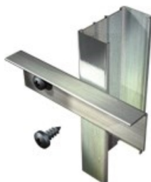
Pan Head Fine Thread Streaker®