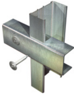
Wafer Head Streaker®